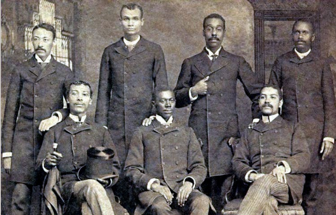
Leonard Medical School Class of 1889