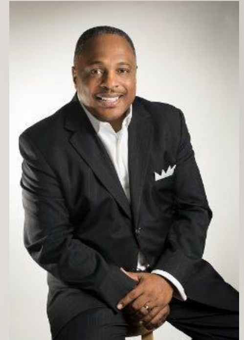
CLASS OF 1983 – ATHLETIC HALL OF FAME Native of Richmond Virginia Pastor of Union Missionary Baptist Church, Lithonia, Georgia